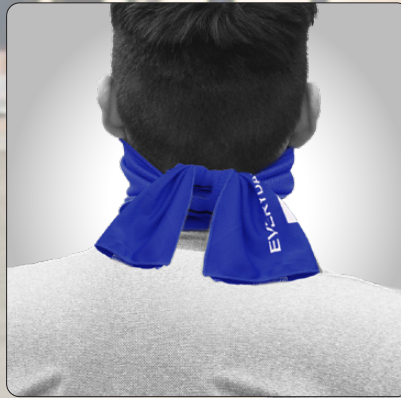
Step #2 Tie Secure Knot