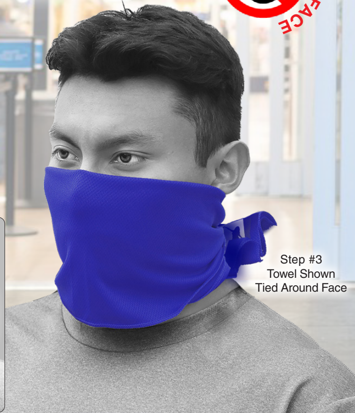
Step #3 Towel Shown Tied Around Face